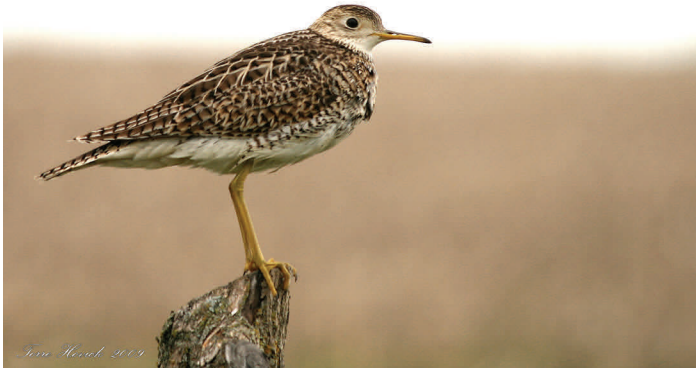
Upland Sandpiper: Photo taken by Torre Hovick.

Additional information can be found in Hovick et al. 2014 and Hovick et al. 2015 (full citations in the references section). Additionally, The Great Plains Fire Science Exchange has resources on fire, fire effects, monitoring, and more at http://www.GPFireScience.org .