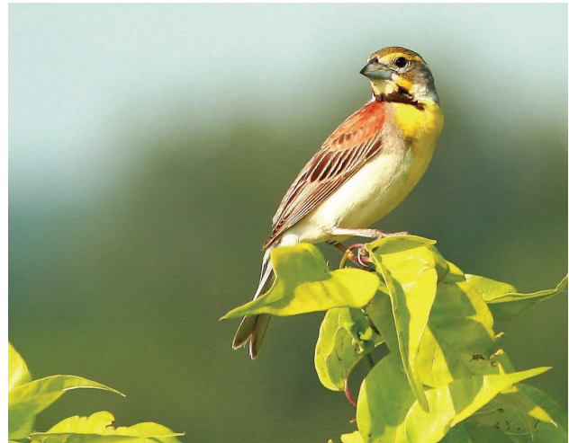
Dickcissel: Photo taken by Torre Hovick.

Restoring heterogeneity increases grassland bird diversity during the breeding and non-breeding seasons. Management focused on restoring natural processes such as interacting fire and grazing may be especially beneficial to specialist species in the southern Great Plains such as LeConte's Sparrow and Smith's Longspur in the non-breeding season and Henslow's Sparrow and Upland Sandpiper during the breeding season. Greater fire-return-intervals and multiple burning seasons (e.g., spring and summer), maximized diversity and stability in the breeding bird community and highlights the importance of heterogeneity for birds that evolved in systems that were a shifting mosaic resulting from frequent disturbance that varied spatially and temporally. Management that focuses on conserving natural grass-