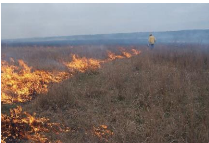
High-intensity fires carry well in high-quality grassland with adequate fuel-loads.

Grassland degradation has resulted from a history of suppression of natural fire, elimination of human-caused fire, and overgrazing by livestock. Two species of native juniper ( Juniperous ashei and J. virginiana ) readily encroach on grasslands when fire has been excluded, creating a juniper woodland system. Fire is often ineffective as a restoration tool in grasslands that have transitioned to juniper woodlands. This is because juniper cover and overgrazing have removed the herbaceous layer needed to support the fire intensity required to kill junipers.