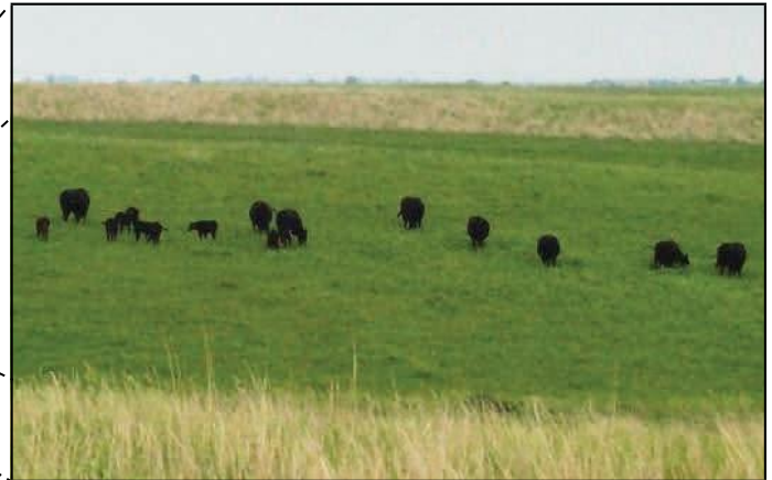
Cattle grazing the most recently burned patch (Center patch) 60 days after a late March burn in Iowa. The other patches (in the foreground and background) are visually obvious.